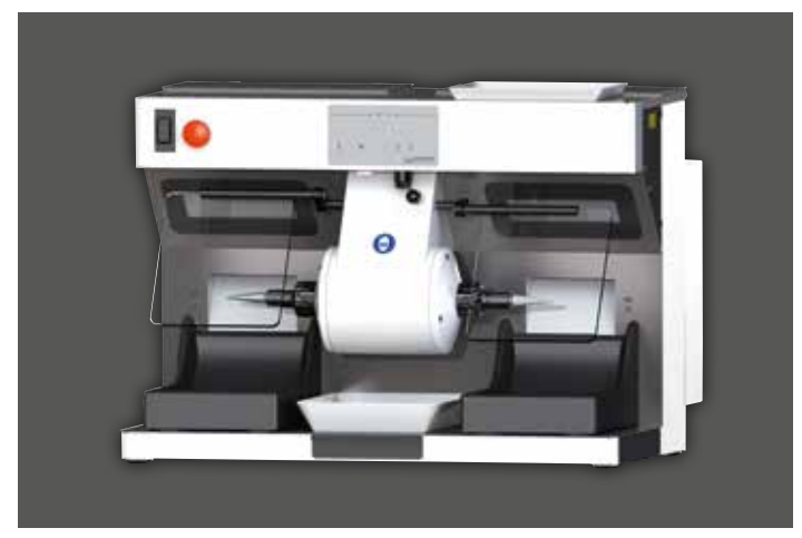
WP-Ex 2000 II (2 settings, 1500 / 3000 min<sup>-1</sup>), basic equipment