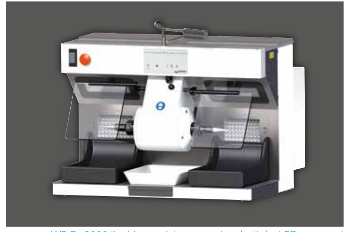
WP-Ex 2000 II with special accessories daylight LED spot and suction protective grids