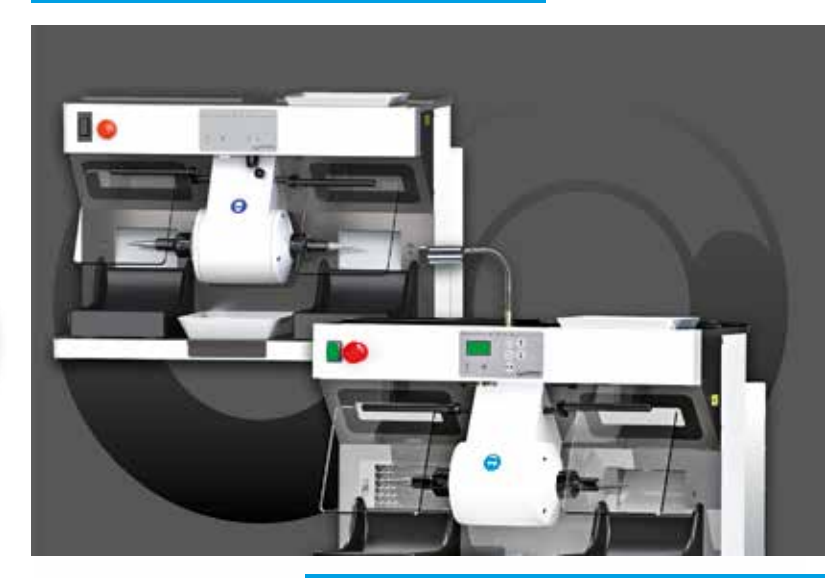
Polishing Compact Units