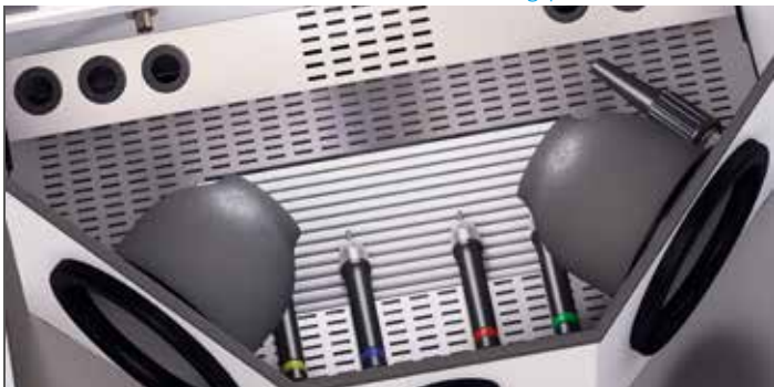
Ergonomically shaped handpieces and a separate air blasting nozzle