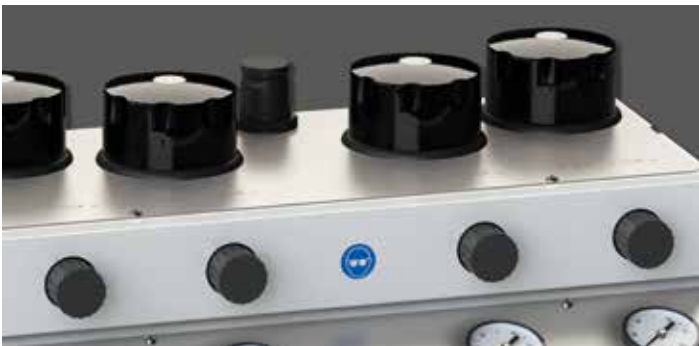
Chambers with individual working pressure, 0.8–6 bar