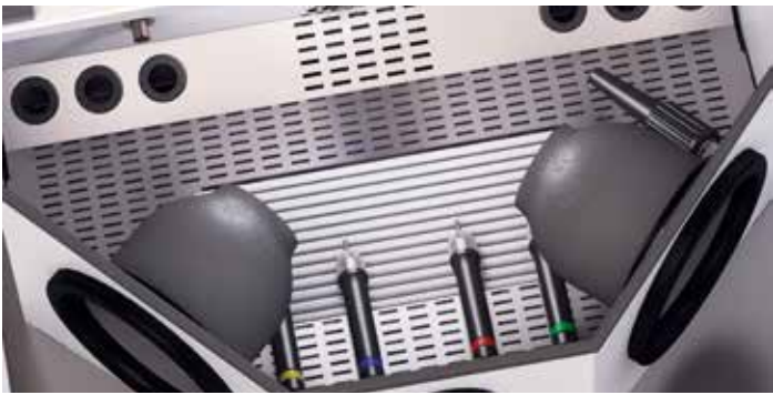
Ergonomically shaped handpieces and a separate air blasting nozzle