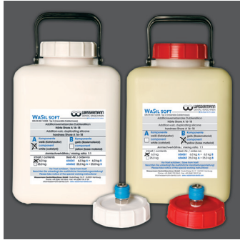
WaSil soft, 6 kg cask, hardness Shore A: 16-18