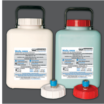
WaSil speed, 6 kg cask, hardness Shore A: > 24